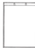
1 Compartment Top View