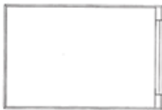
2 Compartment Top View